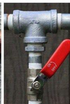
Galvanized Steel & valve