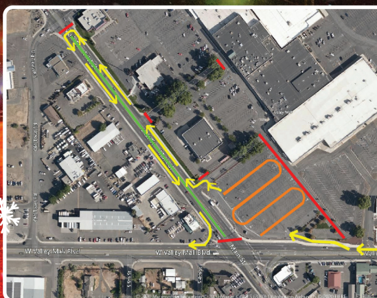
CHRISTMAS PARADE MAP

It's a holly jolly Christmas...and the best time of the year to Drive through a lighted Christmas Parade! Tour stationary lighted Christmas displays from the comfort of your car. This safe family friendly event will queue up at Valley Mall's Sears Parking Lot beginning at 5pm . The reverse parade kicks off at 6pm and travel South down Main Street, wrapping back around and exiting on the Valley Mall Boulevard.