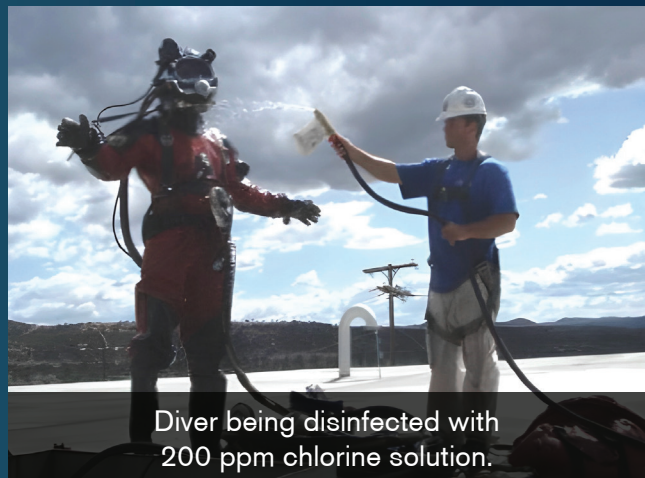
Diver being disinfected with 200 ppm chlorine solution.